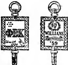
Small Size, No. 20, $4.50.